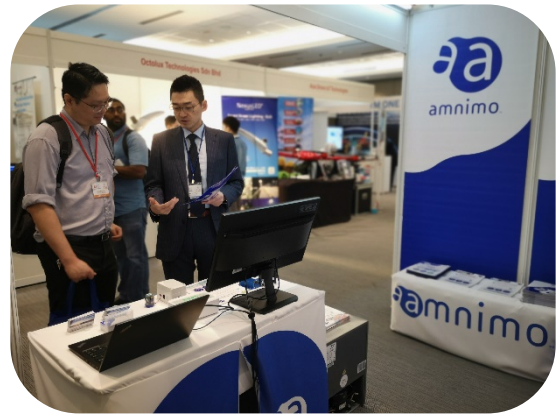
Explaining a partner co-operation model of amnimo