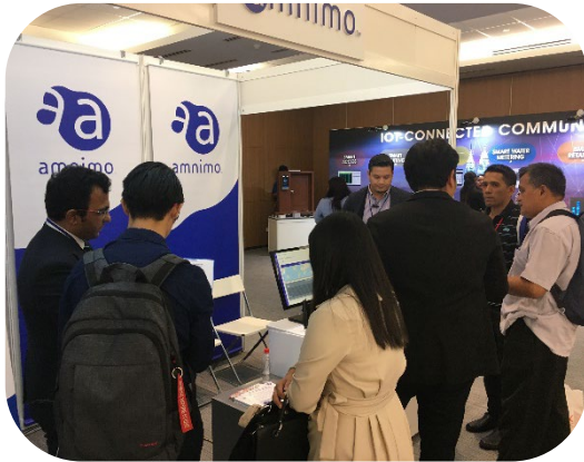
Displaying amnimo sense with Recipes

long-term employment had decreased; there was a shift to work styles in which individual workers gather in short-term projects. Teenager entrepreneurs were emerging who do not work for large companies; a traditional school education system squeezed students into a pattern, and it did not meet the age of Industry 4.0. Everyone needed to continue learning while working, and so on. Throughout the session, many issues were raised that were accompanied by those significant changes in work styles. The trend is the same as in developed countries.